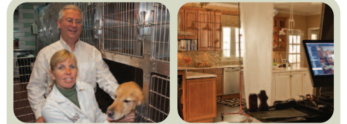
(LEFT) White Oaks Veterinary Hospital , Rapho Township — SBA 504 funds helped Drs. Ron and Lauren Lane, veterinarians and owners, to double the size of their veterinary hospital, allowing them to expand their services and meet increasing customer needs. (RIGHT) the shadowlight group , Upper Leacock Township — An industry leader in commercial photography services, the shadowlight group used SBA 504 funds to move its operation from an 80,000 sq. ft. leased site and purchase a 125,000 sq. ft. facility to accommodate the needs of its growing nationwide clientele.